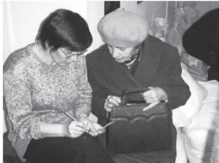
Worker takes information for important church follow-up.